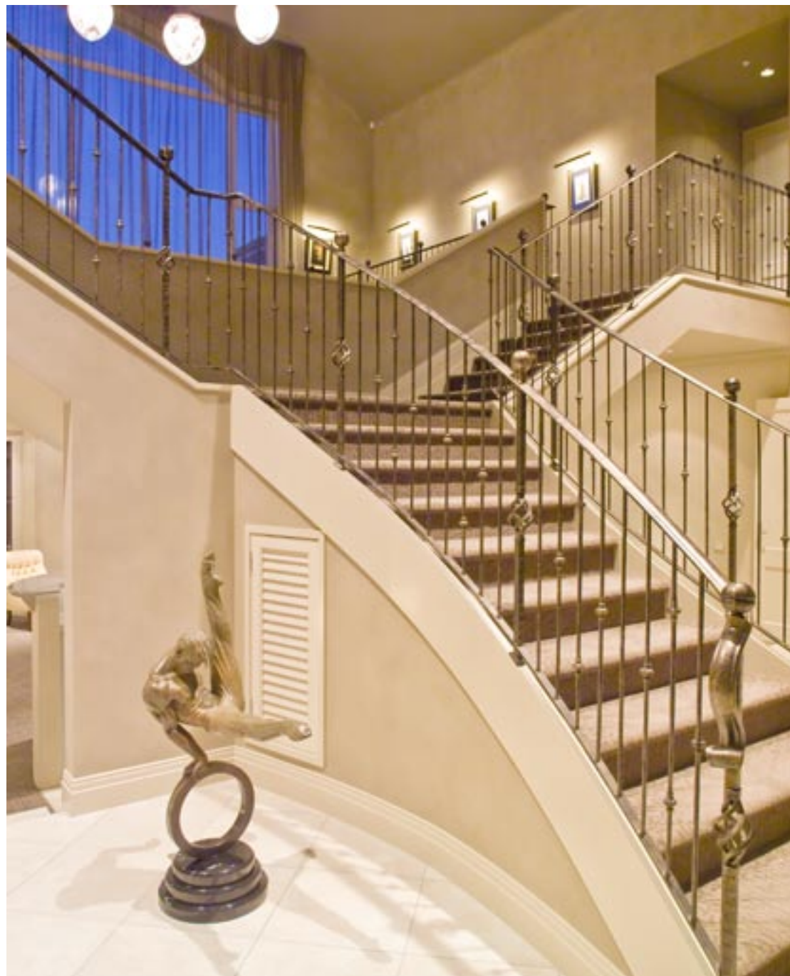
Top and above: The grand staircase features wrought iron balustrades that have a distinctive antique patina. The balustrades were co-designed and manufactured by Classic Iron (Tauranga).