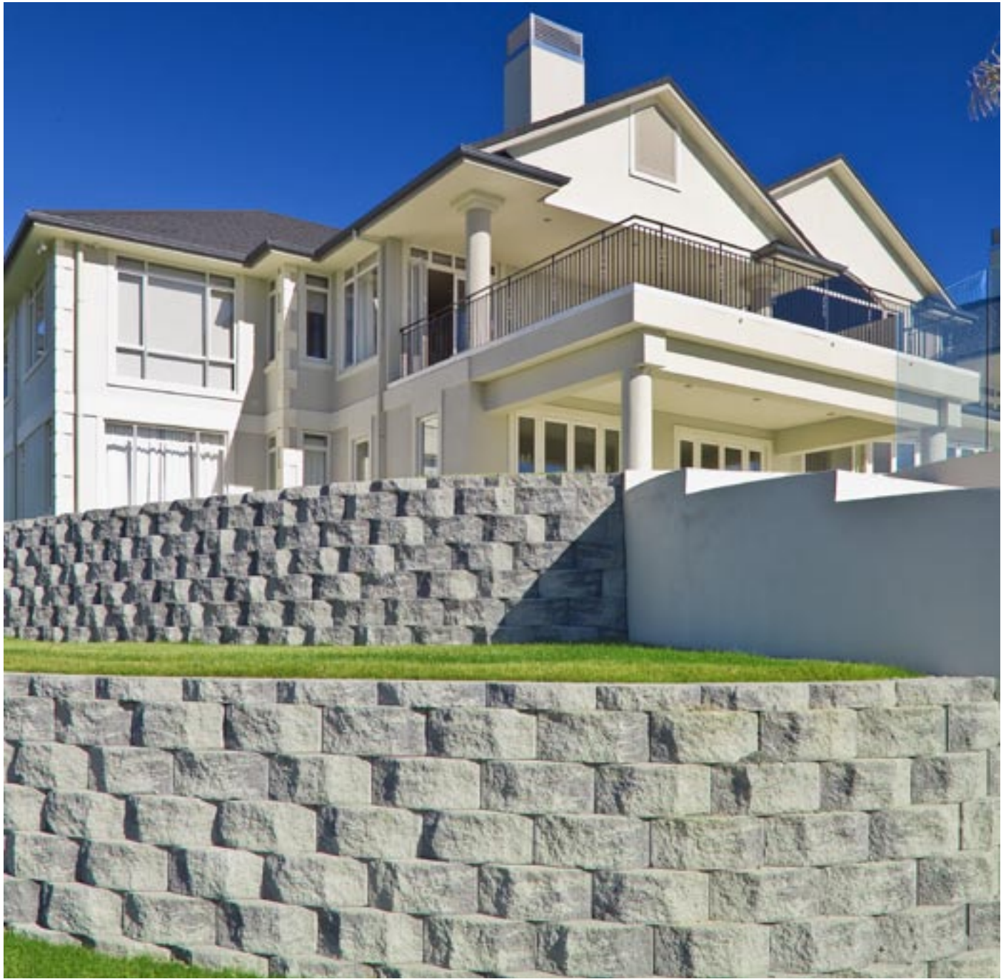
Above: Retaining walls follow the contours of the site. The Keystone segmented retaining wall system from W Stevenson & Sons was specified for its ease of construction and aesthetics. More than xxxxm of Keystone retaining walls were built on the xxha site. Keystone blocks are available in three colours, including Ironsand as shown, and come with either a rock face or straight face.

To maximise the country setting and provide a flat building site, the ground was levelled prior to building. The earthworks removed the top 4m of ground and terraced the site to follow the contours of the land. Designer Mark Brown says there were several reasons for specifying the Keystone segmented retaining wall system from W Stevenson & Sons. “The Keystone blocks provided the neat, textural look we were after,” he says. “Ease of construction was another plus. The blocks can be laid in curves, which made it easy to follow the curves of the land.”