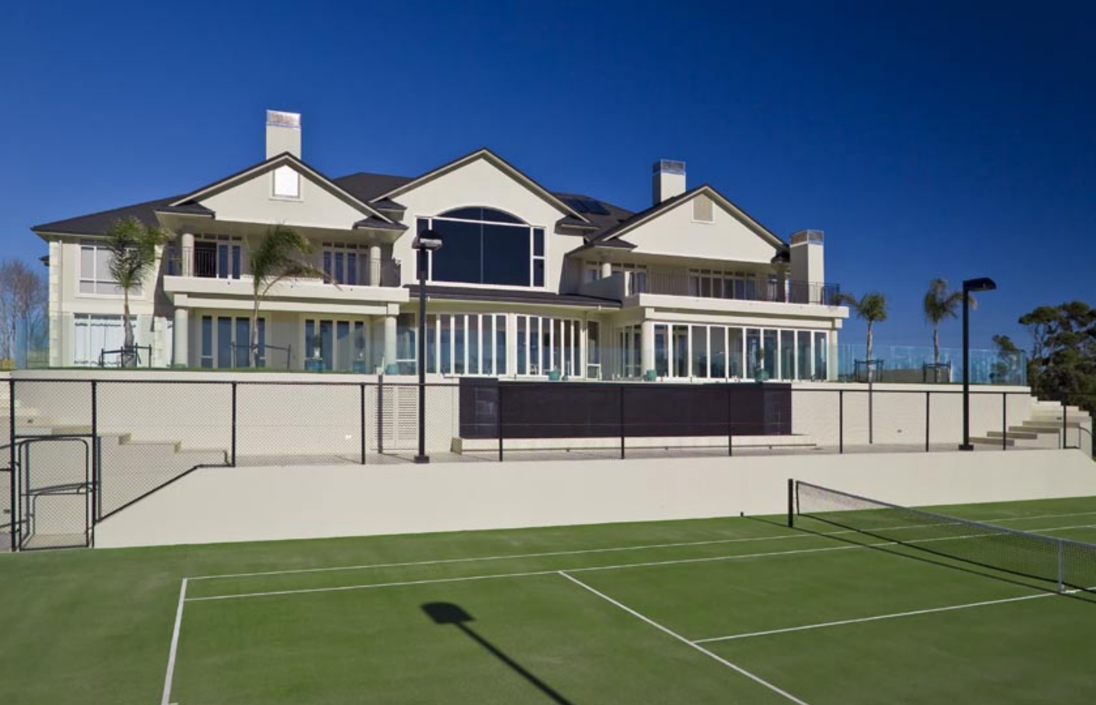
Above: Stehr Brothers, the main contractor for the project, spent three months excavating the site and creating a near-level building site. The company undertakes a wide range of residential and commercial projects, both large and small scale.