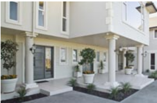
Right: A portico provides a sheltered front entrance, which is positioned directly below the 250m 2 art gallery.

The sheer size of the Whitford residence, its timber-framed construction and the need for a high standard of finish all added to the building complexity for the main contractor. Wok Stehr of Stehr Brothers says the large scale of the project also entailed a high degree of co-ordination with the numerous subcontractors on site. “Everything was constructed on a grand scale,” Stehr says. “The excavation and retaining walls, for example, took three months to complete before work even started on the house. At 900m 2 , the roofing was another challenge. And the timber framing, while quite straightforward in itself, was a major