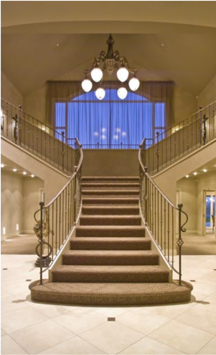
Above: The quality of the craftsmanship of the Whitford residence is a reflection of the expertise that can be expected from members of the Certified Builders Association of New Zealand (CBANZ).