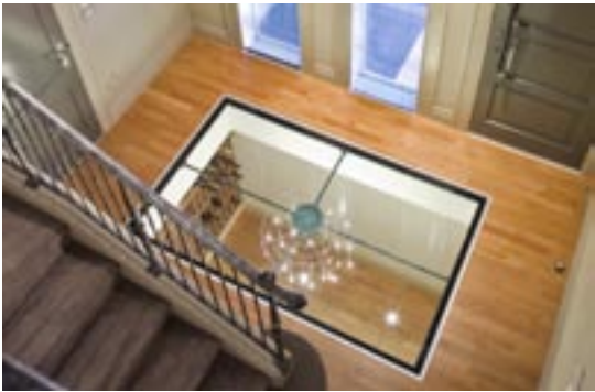
Right: Special features of this project included a glass floor from Nebulite Auckland, which provides a view into the basement wine cellar.